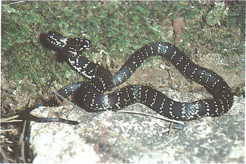
Foto 6. Hoplocephalus bungaroides , Blue Mountains, N.S.W.