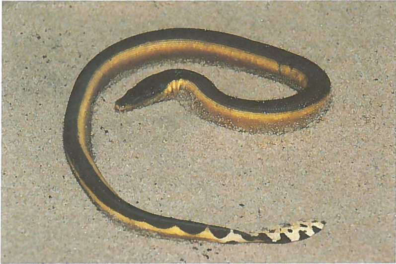
Foto 10. Pelamis platurus , Sydney, N.S.W.

Photo 10. Yellow bellied sea snake Pelamis platurus . From Sydney, NSW. Despite the various restrictions on keeping live reptiles (legal and otherwise), up to 40,000 sea snake skins are exported from Australia each year. Most species biology, population statuses, etc., are hardly known.