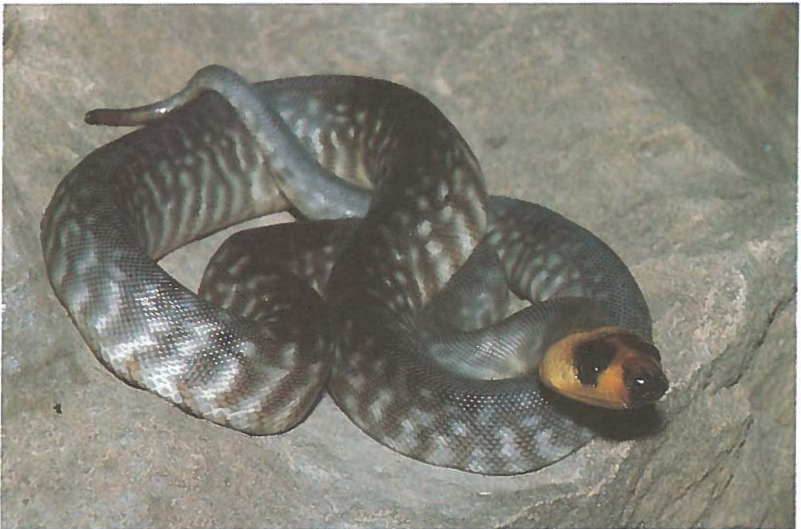
Foto 3. Juvenile Aspidites ramsayi , Charlieville, southwest Queensland.