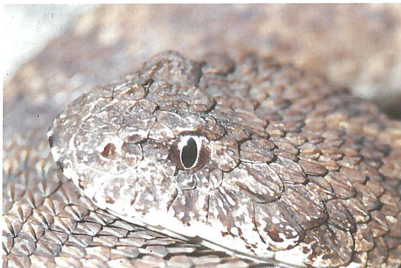
Foto 9. Acanthophis pyrrhus , mannetje/male.