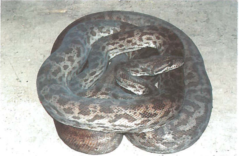
Foto 2. Morelia oenpelliensis , Alligator River, N.T.