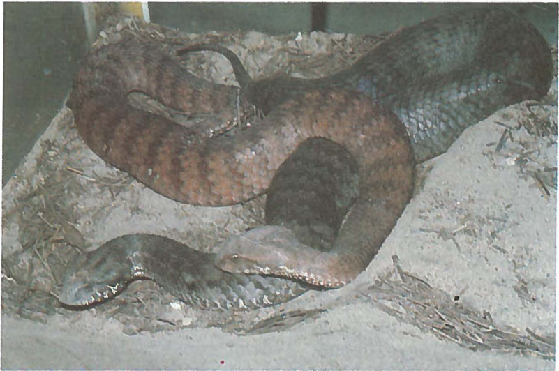
Foto 7. Acanthophis antarcticus , in copula.